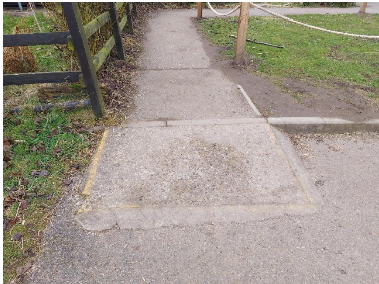
Ramps along the path to the otters and meerkats.