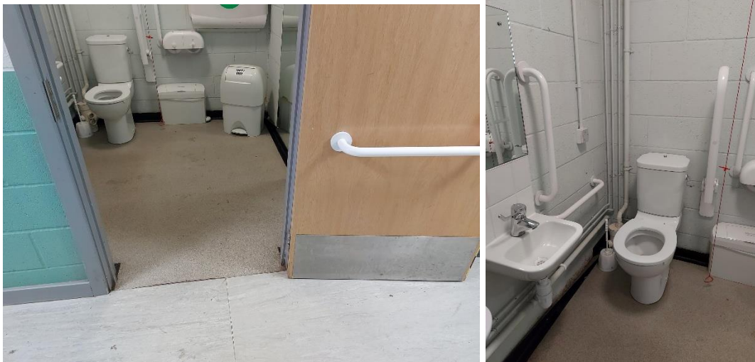
Accessible toilet doorway