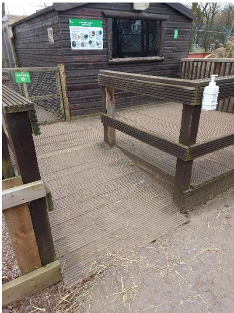
Meerkat viewing platform and ramp