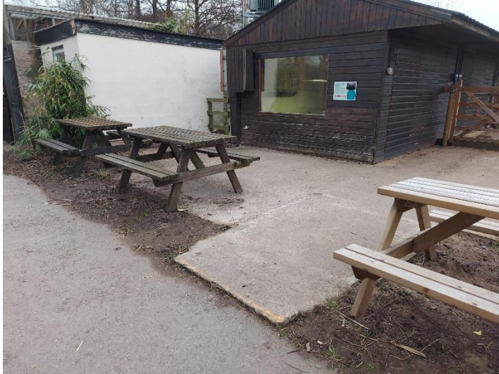
Sulcata tortoise viewing window and picnic area.