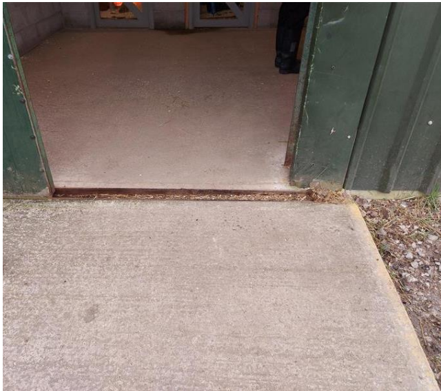
Rabbit barn ramp access.