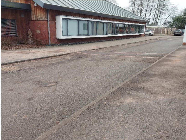
Footpath and speedhump for level access to the main entrance.