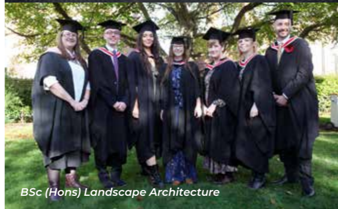
BSc (Hons) Landscape Architecture