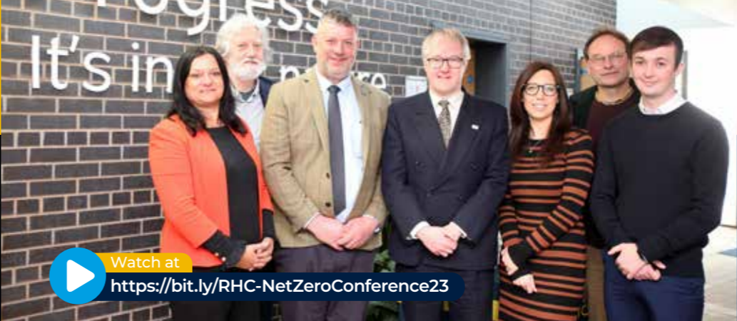
Watch at https://bit.ly/RHC-NetZeroConference23

Action which local businesses, organisations and individuals can take for a more sustainable future were highlighted at a conference run jointly by Reaseheath College and Cheshire East Council.