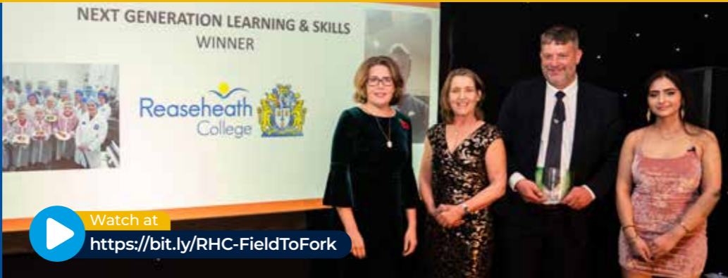
Watch at https://bit.ly/RHC-FieldToFork