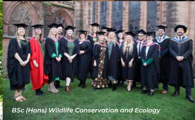
BSc (Hons) Wildlife Conservation and Ecology