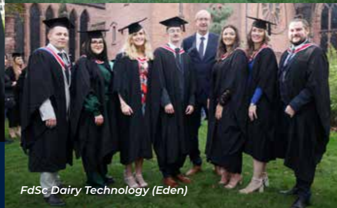
FdSc Dairy Technology (Eden)