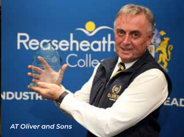
AT Oliver and Sons