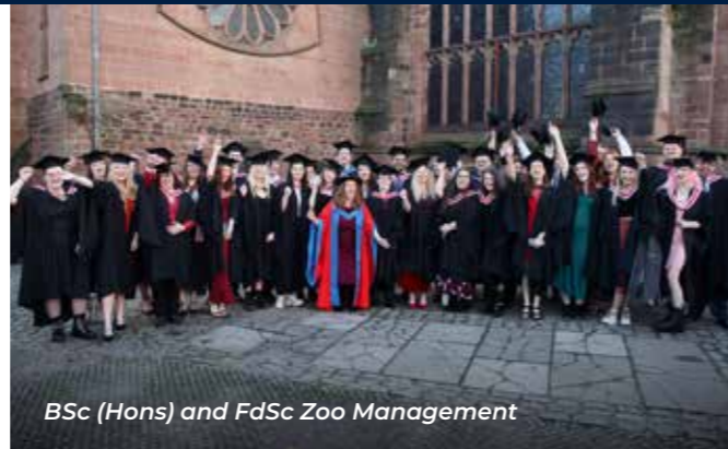
BSc (Hons) and FdSc Zoo Management

Watch at https://bit.ly/UCR-Graduation2022